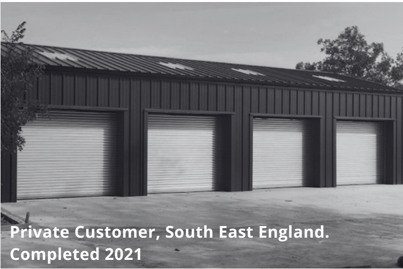
Private Customer, South East England. Completed 2021