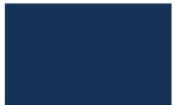
Sapphire Blue* RAL 5003