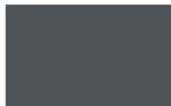
Anthracite RAL 7016