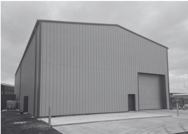
Diffusion Alloys (UK) Ltd, Middlesbrough. Completed 2022