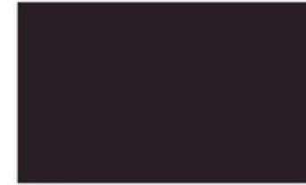
Black RAL 9005 BS 00E53