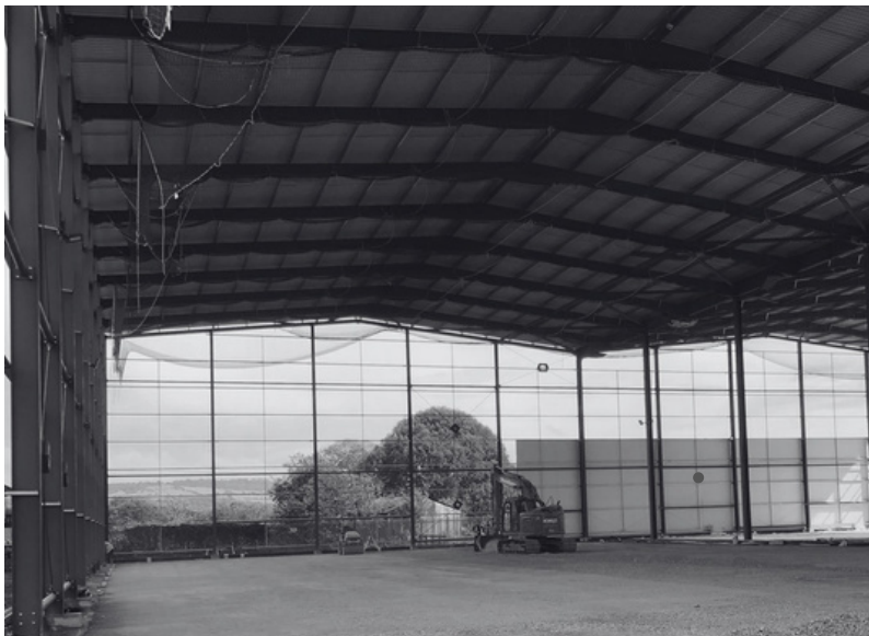
I J MCGILL Transport Ltd, Keynsham. Due for Completion 2023