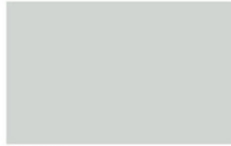
Gull Grey RAL 240 80 05 BS 18B17