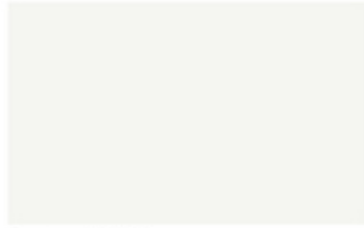
Grey White RAL 9002