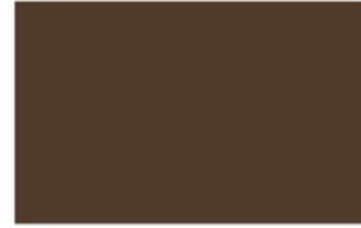
Van Dyke Brown* RAL 8014 BS 08B29