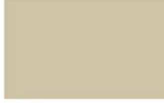
Mushroom RAL 080 70 10 BS 10B19